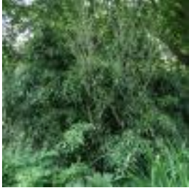
Other - whole plant